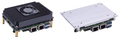
▲ Assembly view