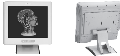
▲ Stand kit